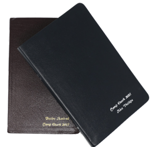
6 YEAR TENURE AWARD: ENGRAVED BIBLE