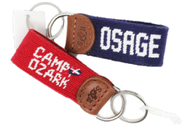
12 YEAR TENURE AWARD: KEYRING