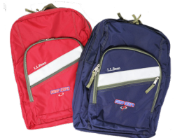
7 YEAR TENURE AWARD: BACKPACK