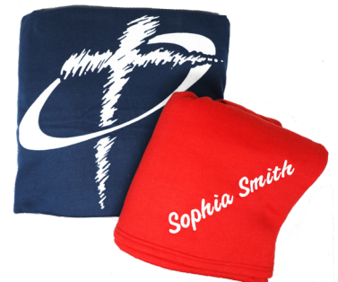
4 YEAR TENURE AWARD: EMBROIDERED BLANKET