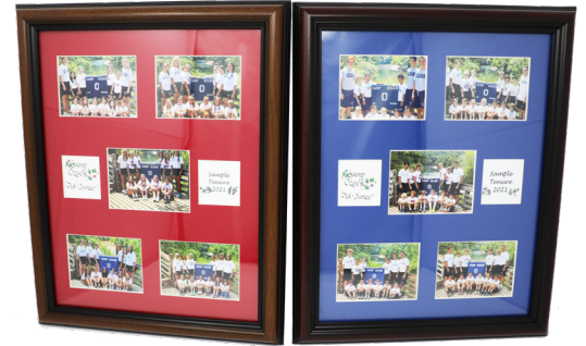
5 YEAR TENURE AWARD: CABIN PICTURE PLAQUE