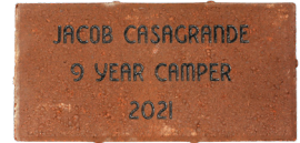
9 YEAR TENURE AWARD: ENGRAVED BRICK