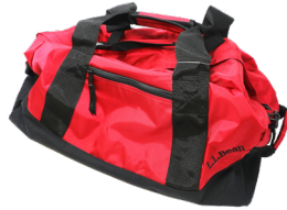
11 YEAR TENURE AWARD: DUFFLE BAG