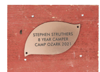
8 YEAR TENURE AWARD: LEGACY LEAF