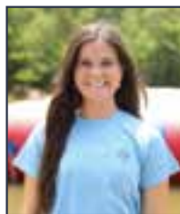
AC TATE Morning Program