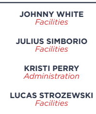
JOHNNY WHITE Facilities