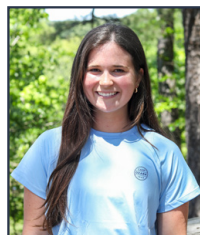
AC TATE Morning Program