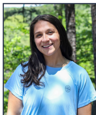
ANNA SCOTT Bistro